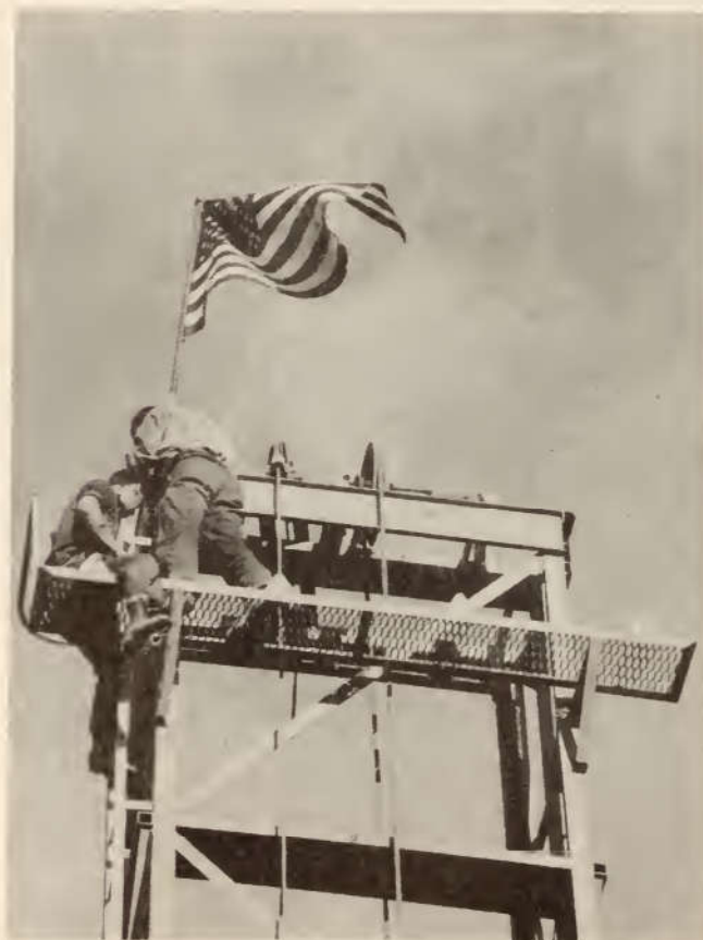
Raising the American Flag on top of the drill rig after the breakthrough of the escape hole.