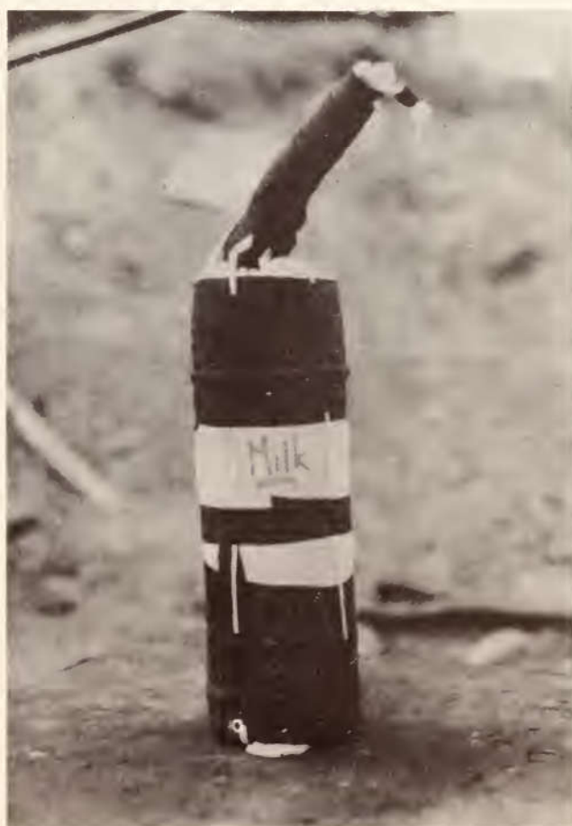
Packaged material ready for the supply line.