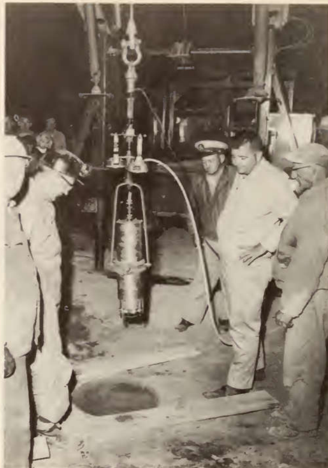
TV Camera used to examine escape hole and search for Mr Bova.