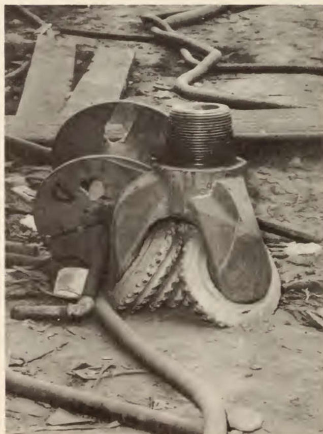
18" drill bit used to make the lower section of the escape hole.