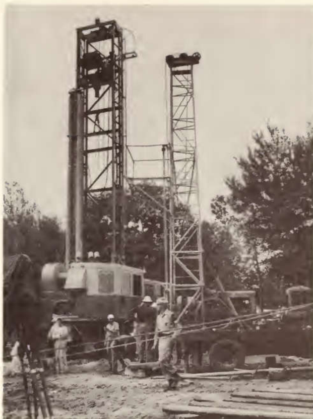
Large Drill used to make escape hole.