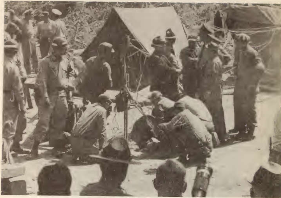
Communications and supply bore hole to the men underground.