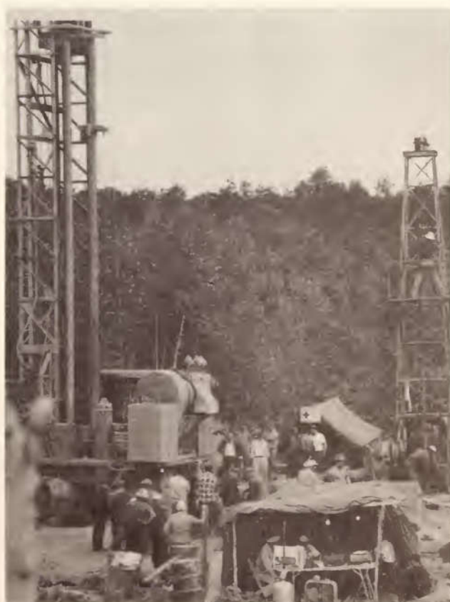
Communications Tent to keep in continuous contact with men in caved area.