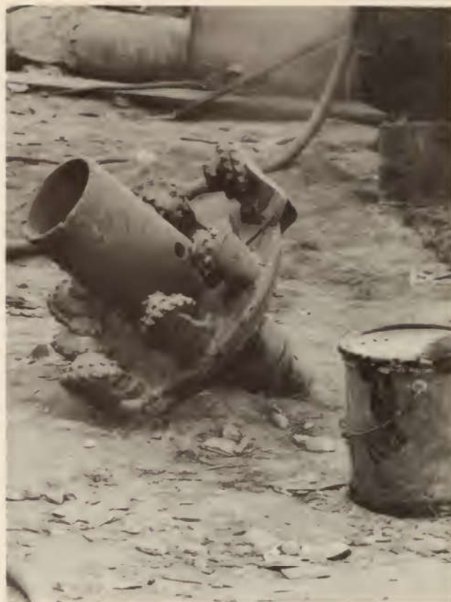
Large drill bit used in the upper section of the escape hole.