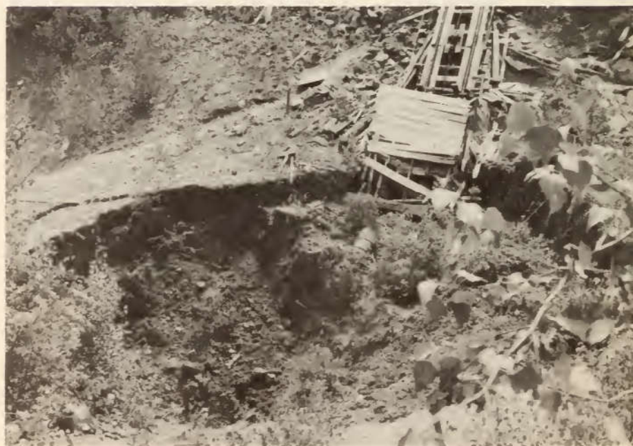
The cave breakthrough on the surface after rescue operations were completed.