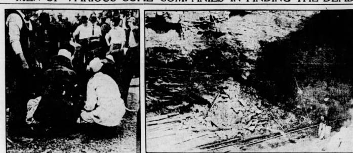
Left, First Aid men working over one of their own number overcome by the blast-dust in Bessie mine following the explosion of the early morning. The rescue men discovered that the body of the miner had been set off by the explosion, and that the body was still in the mine. The main shaft of the mine was filled with debris, and all of it had to be cleared away by the rescue men before the mine could be entered.