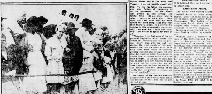
So close did the women who wanted to see the rescue work, following the gas explosion at Bessie Mines, push to the mine entrance, officials of the company were forced to draw them back. The women and children were watching the rescue work from a safe distance, and they were all very anxious to see the rescue work.

The women and children were watching the rescue work from a safe distance, and they were all very anxious to see the rescue work. The women and children were watching the rescue work from a safe distance, and they were all very anxious to see the rescue work.