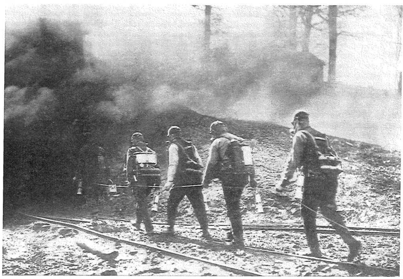
Figure 3 A U.S. Bureau of Mines rescue team enters a mine during a training exercise at the Bureau's experimental mine in Bruceton, Pennsylvania, ca. 1915.

available over the weekend to train the party that ultimately rescued the men.