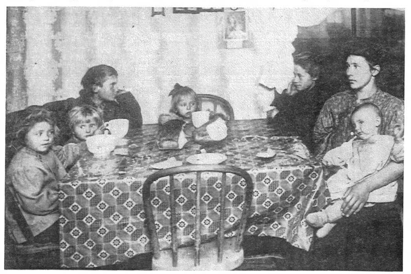
Figure 2 The empty chair belongs to one of the men who died at Cherry. His family numbered among the 607 widows and orphans left by the disaster.

These assessments are misleading, because the mine itself was highly unsafe. Both its methods of operation and layout contributed to the magnitude of the disaster. Right after the fire, in fact, an Engineering and Mining Journal reporter criticized the inadequate fire-fighting equipment at the mine. George Rice himself refrained from publicly criticizing the mine