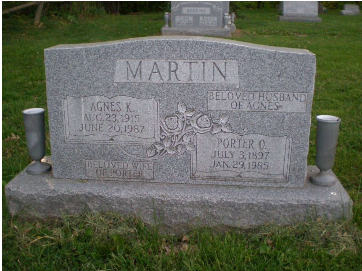
Lawnwood Cemetery, Morgantown, West Virginia.